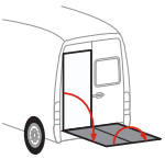
Bär VanLift FreeAccess (A2V)

A2V possible for rear and front wheel drive. S2V just possible for front wheel drive.