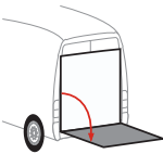
Bär VanLift Standard (S2V)